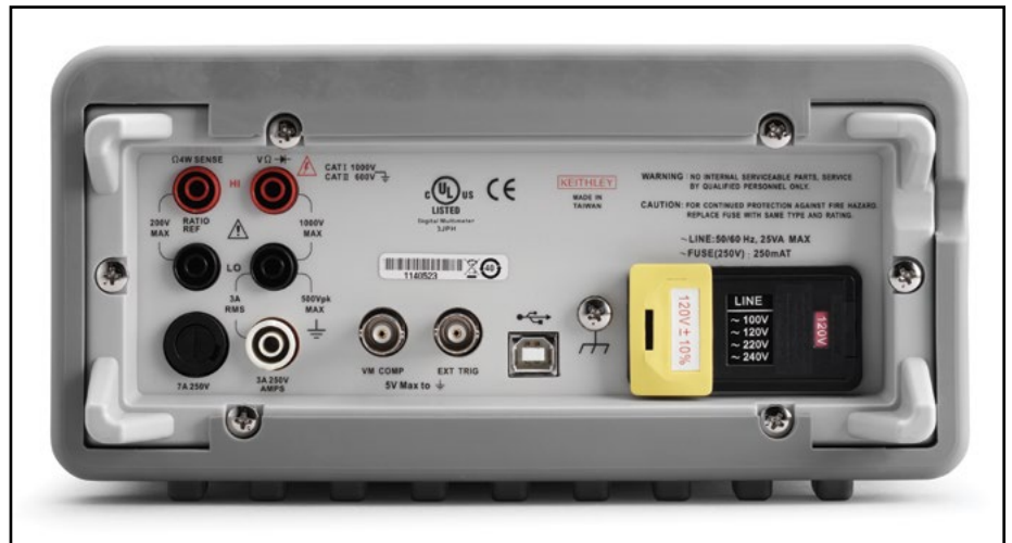
Model 2100 rear panel